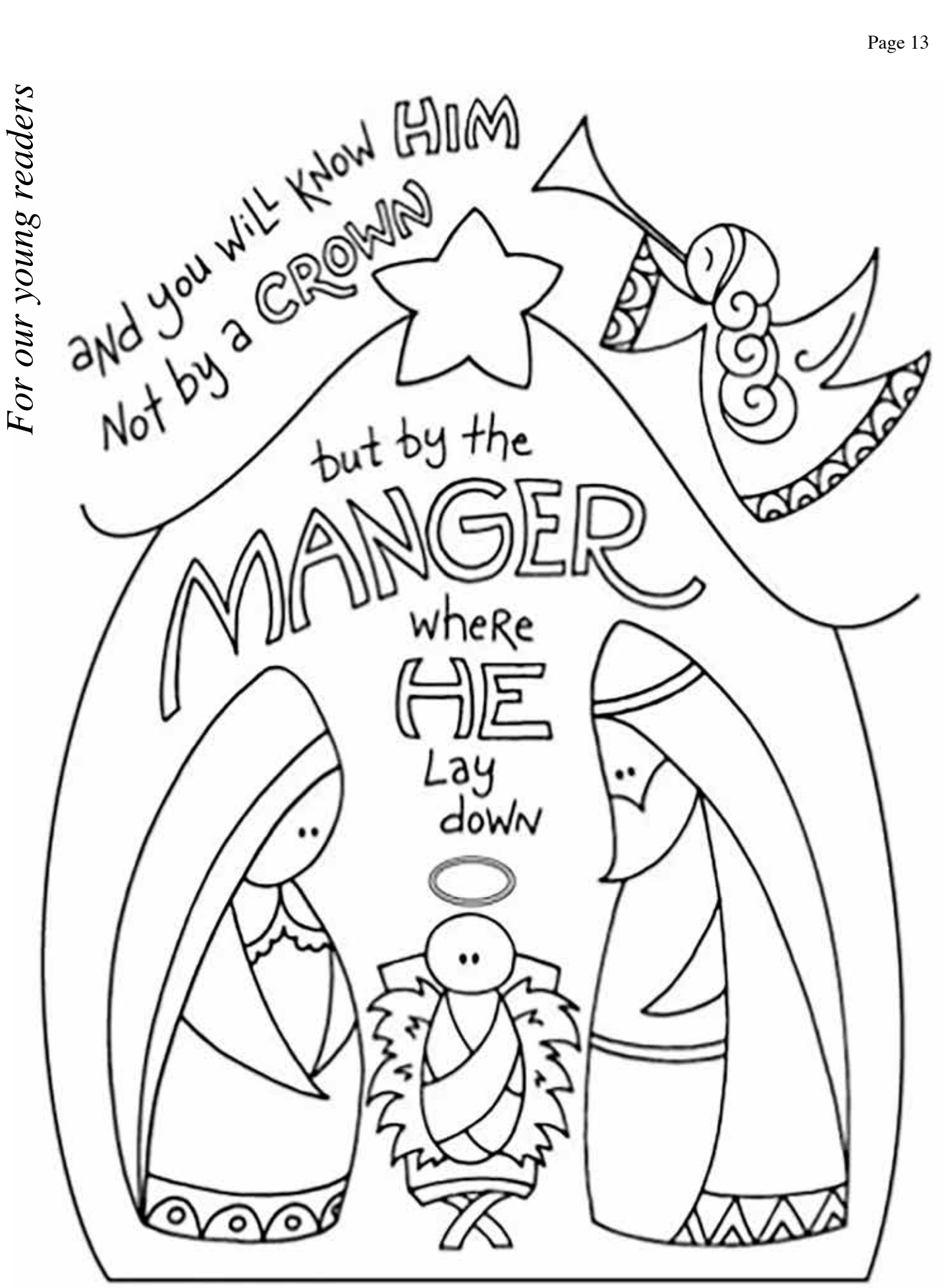
St. Andrew Lutheran Church, Mundelein Illinois 60060 www.standrewmundelein.com