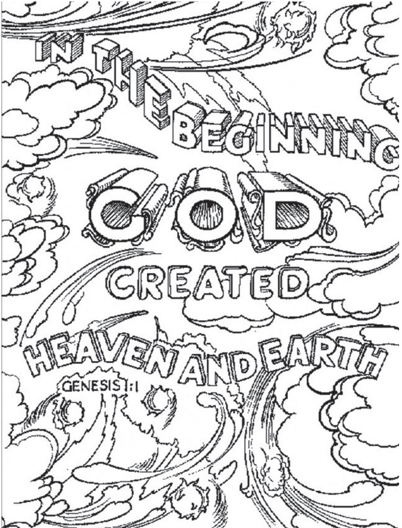
Genesis 1:1 In the beginning God created the heavens and the earth.