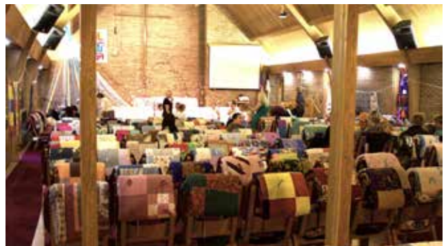
St. Andrew Quilters donated over 300 quilts to Lutheran World Relief

Worship will be at 9:30 am each week, and will generally alternate worship styles.