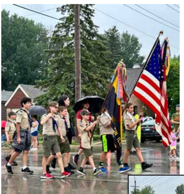
Marching in the 4th of July Parade with a float