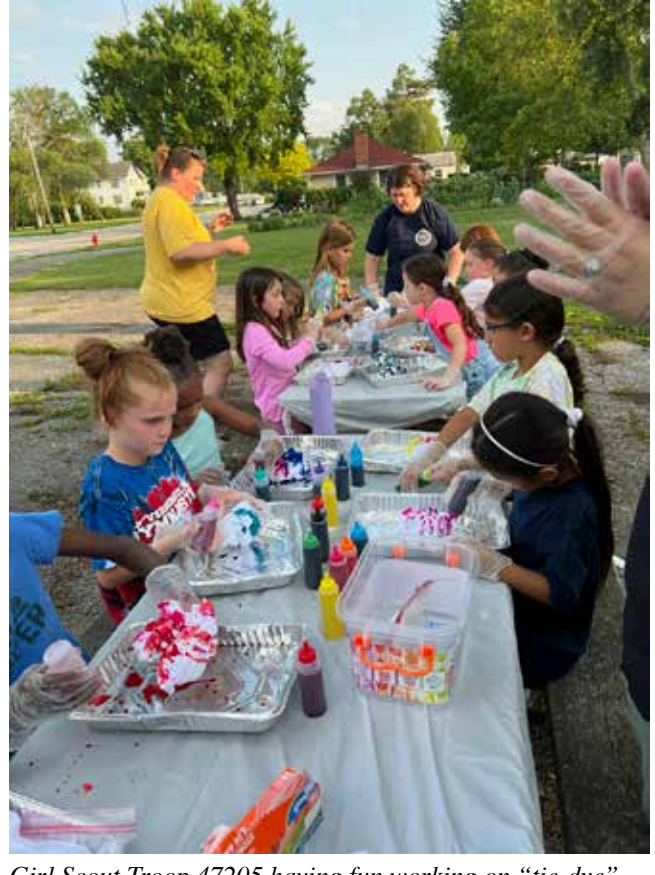
Girl Scout Troop 47205 having fun working on "tie-dye"