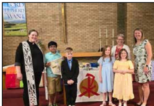
1st and 2nd service

We give special thanks to those that assisted in their guidance and preparations throughout the past weeks and the Christian Education Ministry for their support.