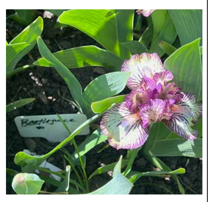
Inside now, hope Beetlejuice survives tonights cold!