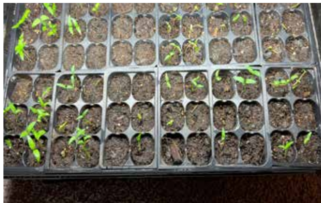
Sweet and hot peppers and starting most of the tomatoes